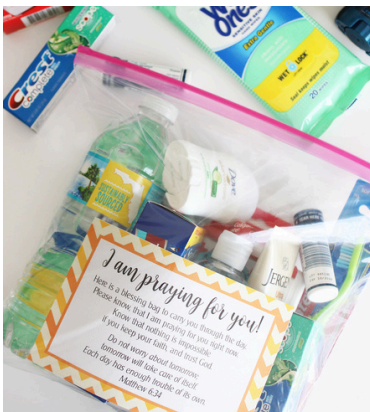
Ideas from Be A Heart Design